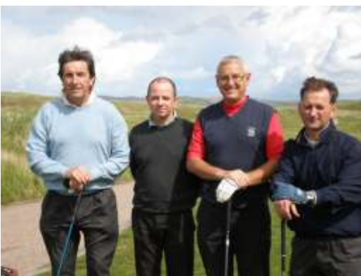
Several of the competing teams in the glorious sunshine